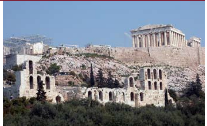
The Acropolis of Athens

L ong ago the ancient poets wrote the first epics of war and love, families and feuds, trickery and revenge, Gods and Heroes. Here, in glorious Greece, you'll see where theater was born, consult the oracle at Delphi, stand where Paul preached to the Corinthians, and walk under the Lion Gate at Mycenae, just as the blind poet Homer recorded it nearly 3,000 years ago.